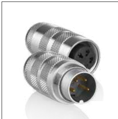
Art. no. 1312001 and 1310841