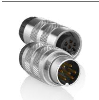
Art. no. 1311201 and 1322401