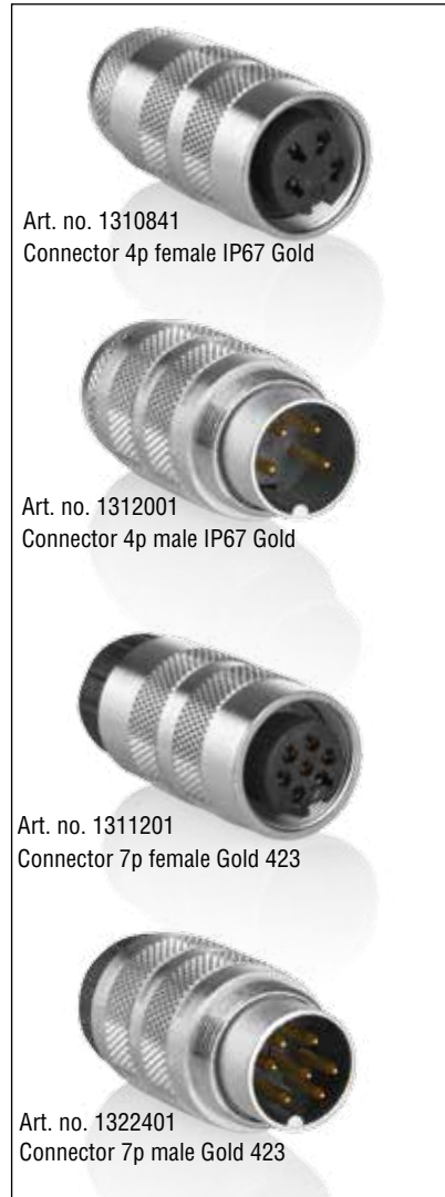
Art. no. 1310841 Connector 4p female IP67 Gold